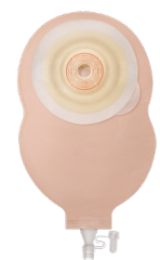
ESTEEM™+ Soft Convex Urostomy

Esteem™+ Soft Convex is the latest addition to our range of one-piece convexity solutions, enhancing your choices when selecting the best convexity option for your patient. The flexibility of Esteem™+ Soft Convex combined with a shallow convexity is designed to be gentle on the skin and deliver comfort to your patient.