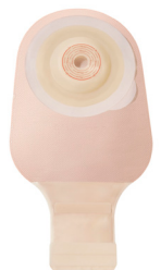
ESTEEM™+ Soft Convex Drainable