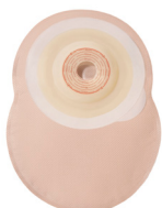
ESTEEM™+ Soft Convex Closed