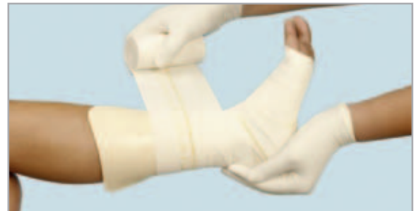
Leg application (Non-Adhesive)