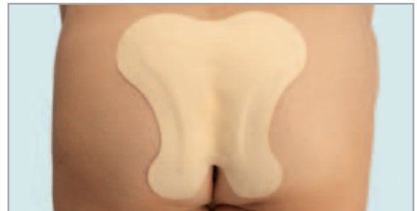
Sacral application (Adhesive)