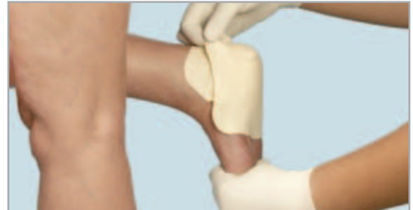
Heel application (Adhesive)

®/TM indicates trademarks of ConvaTec Inc. ©2009 ConvaTec Inc. AP-007036-MM