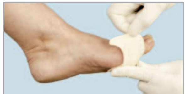
Cut to shape for toe application (Non-Adhesive)

*Please see package insert for full instructions for use.