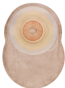
ESTEEM™+ Soft Convex Closed