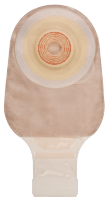
ESTEEM™+ Soft Convex Drainable

Esteem™+ Soft Convex is the latest addition to our range of one-piece convexity solutions, enhancing your choices when selecting the best convexity option for your patient. The flexibility of Esteem™+ Soft Convex combined with a shallow convexity is designed to be gentle on the skin and deliver comfort to your patient.