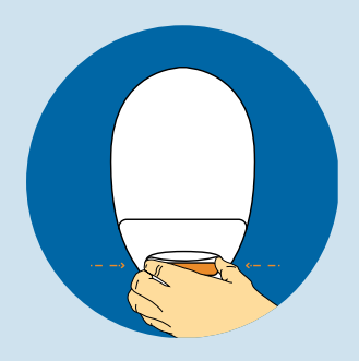
To empty pouch, tilt the tail up towards your body. Peel open the closure and unravel tail. Unlock pouch closure and open the tail by pushing in both ends of the outlet end-strips with fingers; drain pouch.