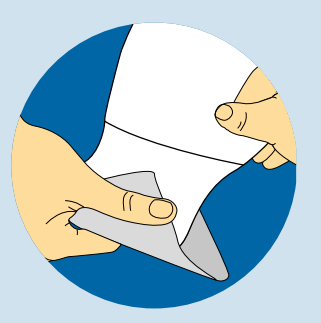
Tips for cleaning the pouch: Support the pouch with one hand and wipe tail of pouch in firm downward motion with toilet tissue in other hand.