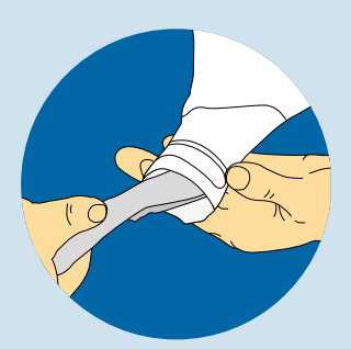
Clean in the inside surface of tail with toilet tissue or baby wipe.