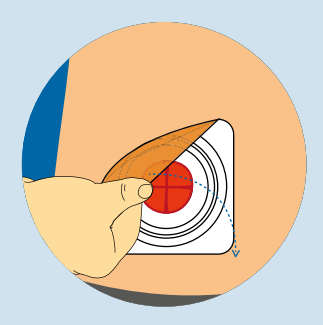
Gently pull the skin barrier down, away from the skin. While supporting the adjacent skin with your other hand.