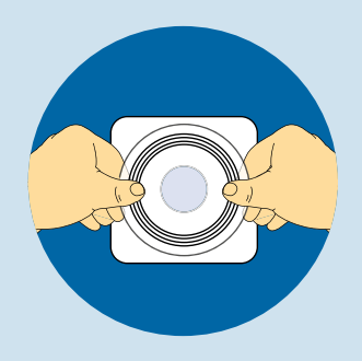
PULL UP Accordion Flange and hold with thumbs on top and fingers underneath. Align flanges of pouch and skin barrier.