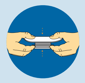
Start at the bottom and apply pressure around the flanges until they snap together. Then place the Accordion Flange in the DOWN position for a flat profile.