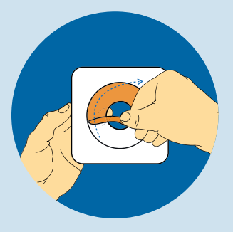
Peel off release liner and centre the opening over the stoma. Apply to clean dry skin.