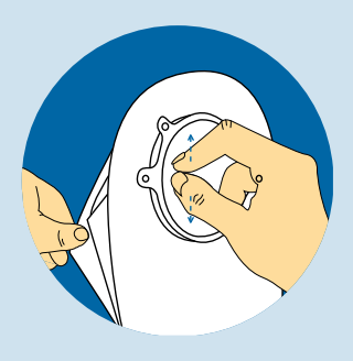
Separate the sides of the pouch to allow some air to enter.