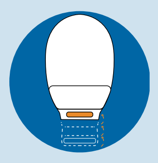
Fold the end up towards you until the interlocking closures line up.