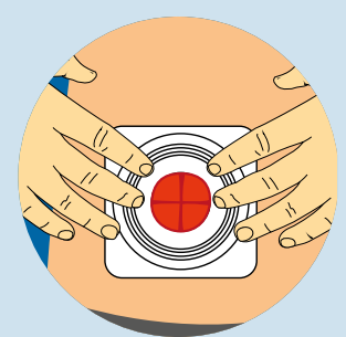
Remove white release paper and press against the skin. Smooth the tape collar and hold the barrier in place for 30 seconds.