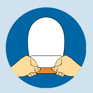
Press and pinch around the closure to secure.