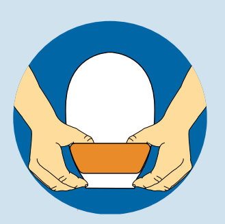
Turn the Lock-it-Pocket™ inside-out to tuck tail inside.