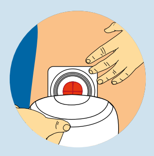
To remove the pouch from the flange, hold the flange down with one hand and gently un-snap the pouch.