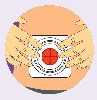
Press gently against skin, smoothing out any wrinkles.