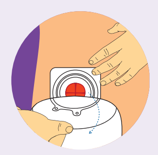
To remove the pouch from the baseplate, hold the baseplate down with one hand and gently un-snap the pouch. Only remove the pouch if replacing with a new, clean pouch.