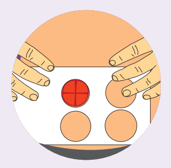
Measure the stoma and select the appropriate size skin barrier.