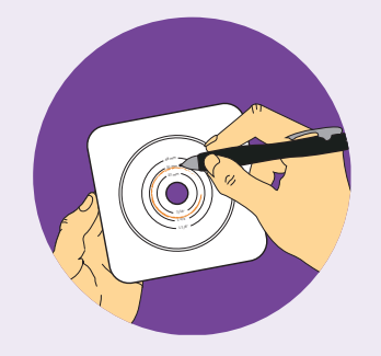
Cut-to-fit baseplate Trace the stoma size on the centre of the clear release line on the reverse of the barrier, then cut an opening about 1/8" (3mm) larger than your tracing.