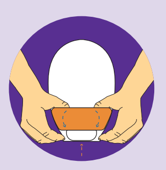
Turn the Lock-it-Pocket<sup>™</sup> inside-out to tuck tail inside.