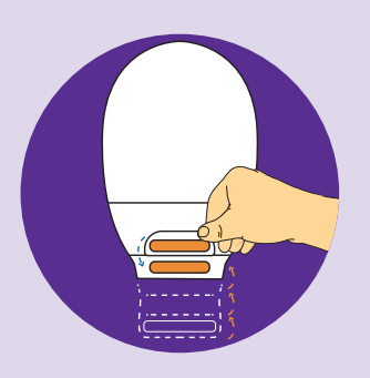
Roll the end up towards the pouch until the interlocking closures line up. Press and pinch around the closure to secure.