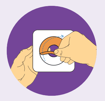
Peel off release liner and centre the opening over the stoma. Apply to clean dry skin.