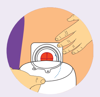
Position pouch over the baseplate. Gently press the coupling together starting at the bottom until the baseplate and pouch "snap" in place and feel secure. Always double check the coupling is completely closed, if not repeat the steps.