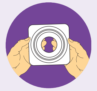
Pre-cut baseplate Select baseplate with pre-cut opening slightly larger than your stoma.