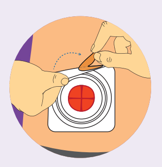
If present, peel off the white release liner from the tape border.