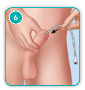
STEP 6: Slide the catheter slowly and smoothly into the opening of your urethra and into your bladder until the urine starts to flow. Make sure the funnel end is pointing into a container.