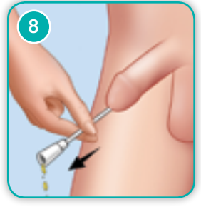
STEP 8: To make sure the bladder is emptied completely, remove the catheter slowly and stop if more urine starts to flow.

When the bladder is empty withdraw the catheter slowly. Discard the catheter after use. Wash your hands.