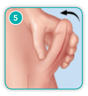
step 5: Hold your penis upward towards your stomach. This will make it easier to guide the catheter into your bladder. Do not squeeze your penis too hard as this can block the opening of the urethra.