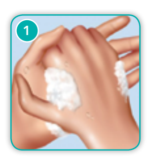
STEP 1: Wash hands thoroughly with soap and water.