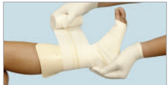
Leg application (Non-Adhesive)