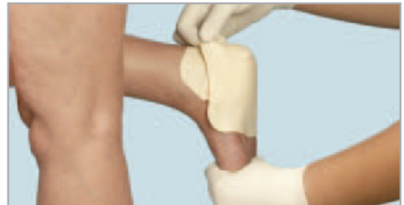
Heel application (Adhesive)

*TM indicates trademarks of ConvaTec Inc. ©2009 ConvaTec Inc. AP-007036-MM