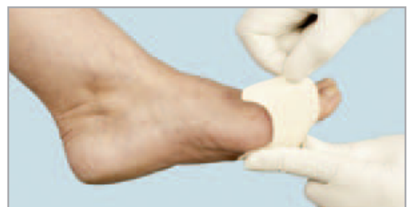
Cut to shape for toe application (Non-Adhesive)

*Please see package insert for full instructions for use.