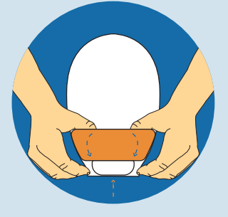
Turn the Lock-it-Pocket™ inside-out to tuck tail inside.

Roll the end up towards the pouch until the interlocking closures line up. Press and pinch around the closure to secure.