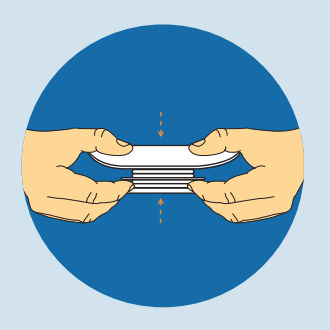
Start at the bottom and apply pressure around the coupling until the pouch and baseplate snap together. Then place the Accordion Baseplate in the DOWN position for a flat profile.