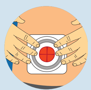
Remove white release paper and press against the skin. Smooth the tape collar and hold the baseplate in place for 30 seconds.