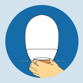
To empty pouch, tilt the tail up towards your body. Peel open the closure and unravel tail. Unlock pouch closure and open the tail by pushing in both ends of the outlet endstrips with fingers; drain pouch.