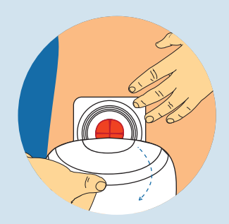
To remove the pouch from the baseplate, hold the baseplate down with one hand and gently un-snap the pouch. Only remove the pouch if replacing with a new, clean pouch.