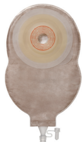
ESTEEM™+ Soft Convex Urostomy

Esteem™+ Soft Convex is the latest addition to our range of one-piece convexity solutions, enhancing your choices when selecting the best convexity option for your patient. The flexibility of Esteem™+ Soft Convex combined with a shallow convexity is designed to be gentle on the skin and deliver comfort to your patient.