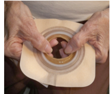
Ease of use when using Moldable Technology*