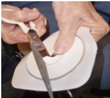
Difficulty in cutting a cut-to-fit barrier