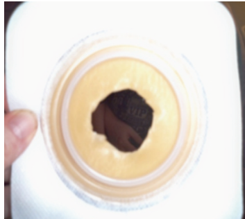
Irregular opening with potentially sharp edges. Patient's often do not have an appropriate scissor in the home to effectively cut skin barriers.