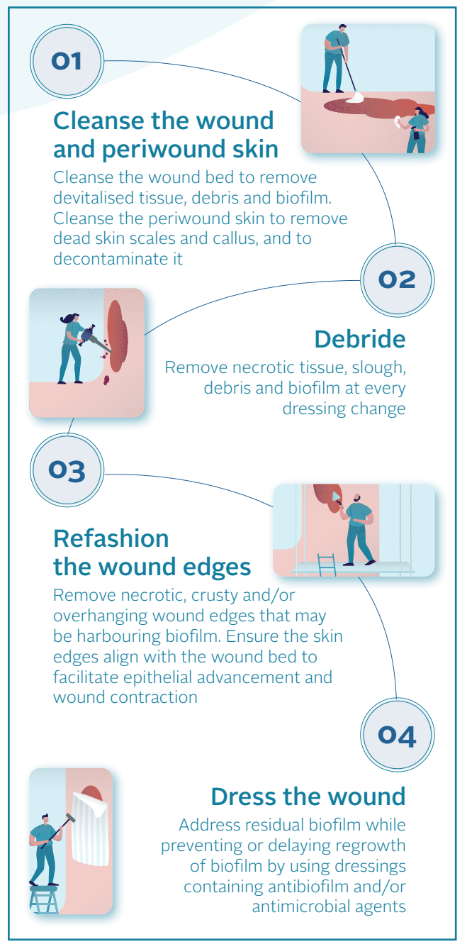
Figure 1. The four activities of Wound Hygiene<sup>1</sup>

whether biofilm is present when completing a routine wound assessment.<sup>26</sup> Furthermore, 70.1% (n=897) of respondents (N=1280) said they use an antibiofilm strategy to manage biofilm in wounds.<sup>26</sup> Over the last decade, biofilm management practices consisted of regular debridement followed by antibiofilm reformation strategies, including the use of topical antimicrobial dressings.<sup>25</sup>