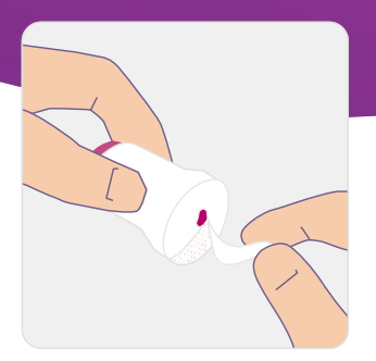
Pull gently to remove the paper from the adhesive, being careful not to touch the adhesive.