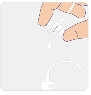
Step 5. Connect to the pump and prime the tubing according to instructions provided by the pump manufacturer.