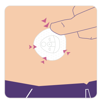
Secure the adhesive by pressing the tape down onto the skin.